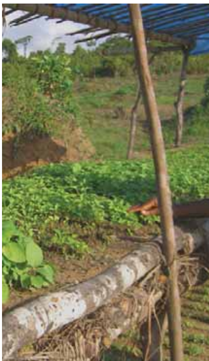
Seedlings on a raised seed bed.

It is important not to apply any fertilizer. Young seedlings need soil low in nutrients, but they love loose, airy soil. Therefore, it is advisable to add some sand, sawdust (not from eucalyptus),