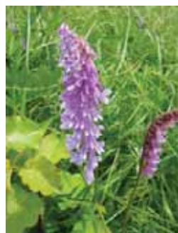
Leguminous green manures such as mustard (above) and desmodium (left) add nitrogen to the soil apart from increasing organic matter that helps improve soil structure.