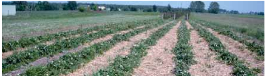
The mulch between the strawberry lines protects the berries and keeps the soil moist.

For the same reason, strawberries should not be grown close to these crops. On the contrary, intercropping with beans, spinach or onions can be very beneficial.